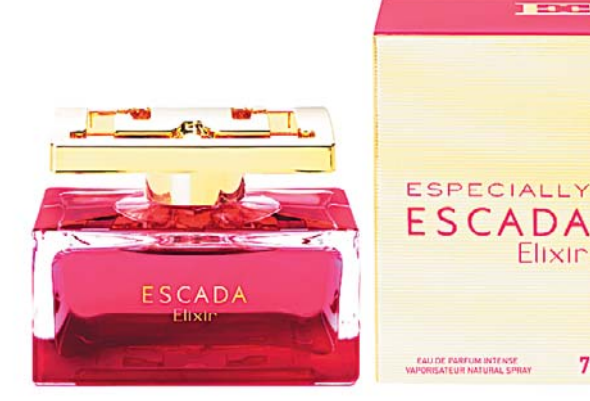
Especially Escada perfume