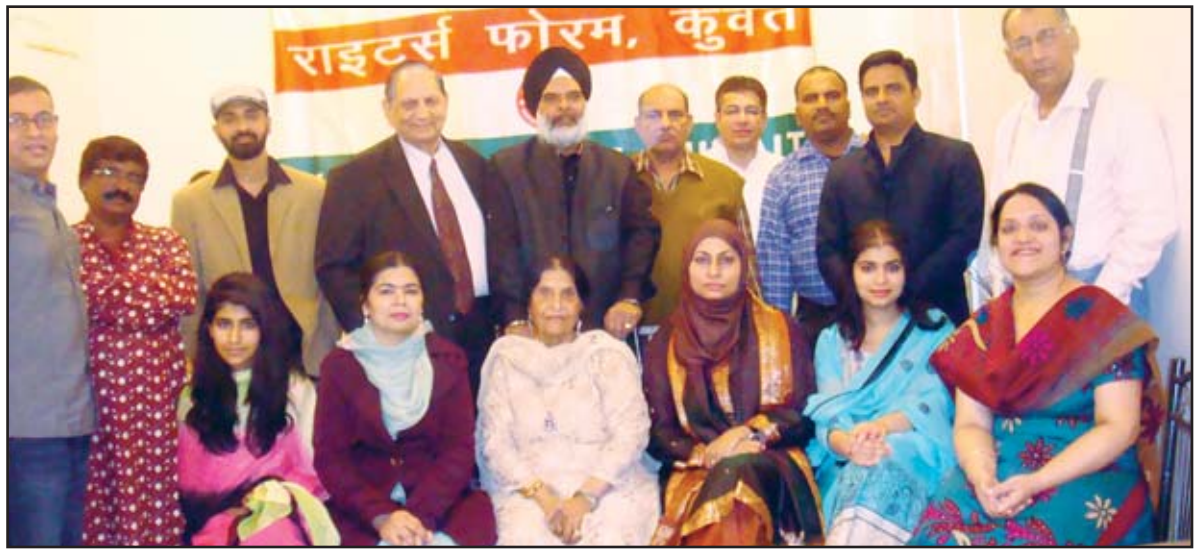
A photo from the event

Concours D'Elegance 2015: For car aficionados there's nothing like seeing rare antique cars in motion with sights & sounds teleporting them back in time. Now you can enjoy all the nostalgia and thrills once again during the fourth Kuwait Concours D'Elegance classic car competition on February 11-18, 2015 organized by the Historical, Vintage &