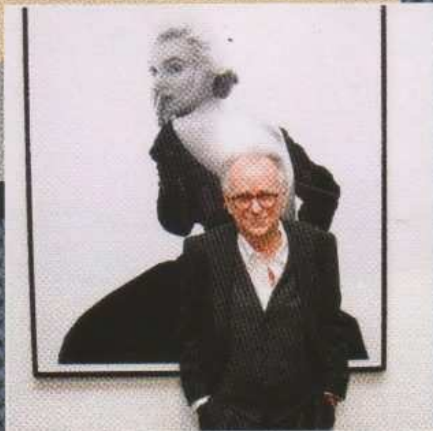
The exhibition of Bert Stern's photographs of Marilyn Monroe runs from March 18-April 18 at the JAMM art gallery, Al Quoz, Dubai, info@jamm-art.org

BERT STERN: "Vogue wanted more fashion shots using a lot of different dresses, including the black Dior. The chinchilla coat was great; the veil was Vogue's idea. Then she got fed up with the clothes and wanted to go back to less things. The toga shot was taken at the end of the night, just Marilyn and I. There was great energy and lots of champagne."